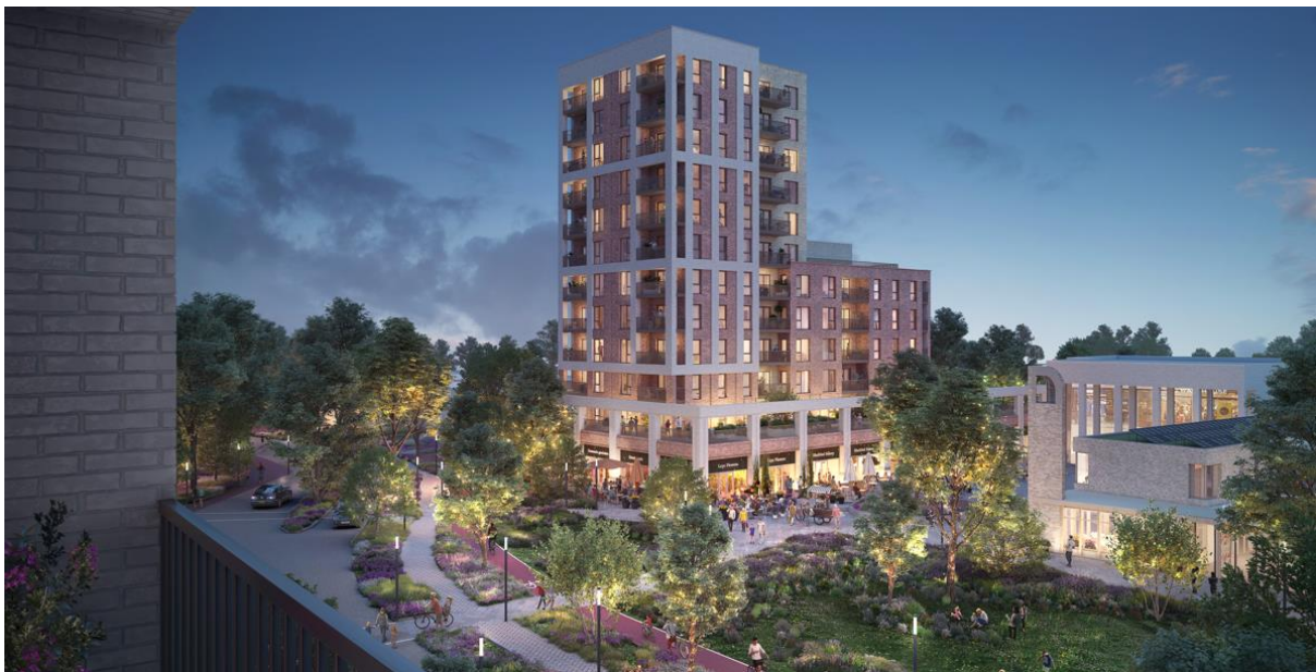
Above: Architect's visualisation of the proposed Blackbird Leys District Centre, showing new landscaped public spaces, new homes and shops in Block A, a Community Centre to the back (still to be designed) and the proposed redeveloped Church of the Holy Family (not part of this scheme).

As work begins, we'll continue to write regularly to the community and provide updates. You can also visit the Blackbird Leys website for more information: www.blackbirdleys.co.uk .