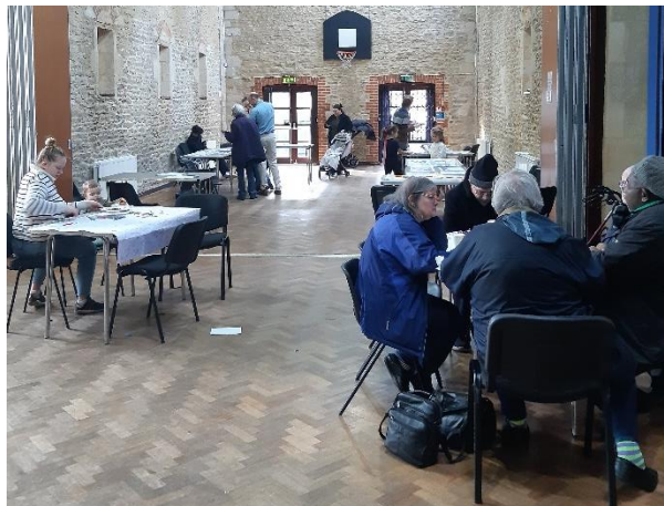
Above: photos from some of the community events we have met you at